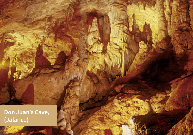
Don Juan's Cave, (Jalance)

In terms of monuments, particularly worthy of note is the 18th-century baroque parish church of Our Lady of the Angels ( Nuestra Señora de los Ángeles ). Also the Palacio del Barón de Cortes de Pallás , a 17th-century mansion.