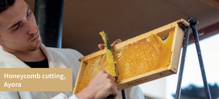
Honeycomb cutting, Ayora

wild boar, genets, hares and rabbits; also birds of prey like the booted eagle, golden eagle, short-toed snake eagle, tawny owl, kestrel, hobby, sparrowhawk and other smaller species, such as the hoopoe, jay, red-legged partridge and woodpigeon.