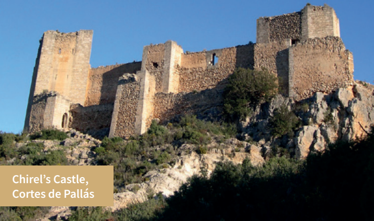
Chirel's Castle, Cortes de Pallás

with altitudes exceeding a thousand metres, covered in pine trees and rosemary, broom, esparto grass and thyme, alternating with junipers, kermes oak and arbutus trees. Puntal del Conejo (1066m), Montemayor (1105m), Caroché (1128m) and the Pico Palomera which, standing at 1260m, is the region's highest peak.