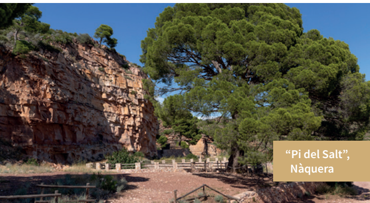
“Pi del Salt”, Nàquera

In Riba-roja de Túria , with sections of Roman aqueducts, Visigoth sites of Valencia la Vella (mid-6th century) and Pla de Nadal (7th century), the Moorish castle, the 18th century water tank, the molino del Conde (Count's mill) and the Miller's house, the old Bridge, the neo-Classical church of la Asunción , the neo-Gothic refuge-school of la Sagrada Familia and the Spanish Civil War trenches. Three museums with Visigoth, Islamic and ethnological artefacts. The surroundings of Riba-roja and the Turia nature park are ideal for all kinds of outdoor sports such as mountain biking, kayaking down rivers, zip line, hiking, routes on horseback, cycling and much more. The Maldonado park also offers rides in miniature steam trains.