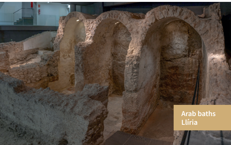
Arab baths Llíria

Particularly worthy of note in Benissanó is the 15th century Castle-Palace, built on the tower that defended the Islamic hamlet. It has a quadrangular floor plan, with a crenellated tower, Gothic mullion windows and coffered ceilings, and Gothic tile flooring. The walled enclosure still has the gates of Llíria , el Pou , Bétera and the Valencia gate from the early 16th century.