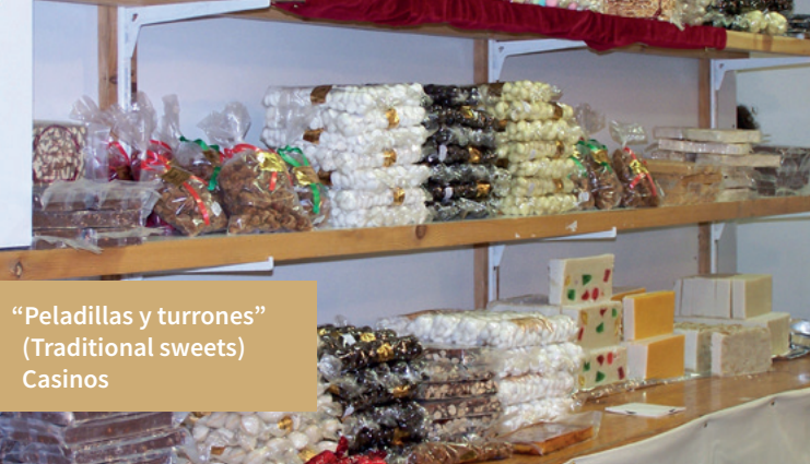
“Peladillas y turrónes” (Traditional sweets) Casinos

Notable features of the town’s historic-artistic heritage are the Islamic water tank, the ruins of the castle and the church of Santa Catalina Mártir , dating from 1900.