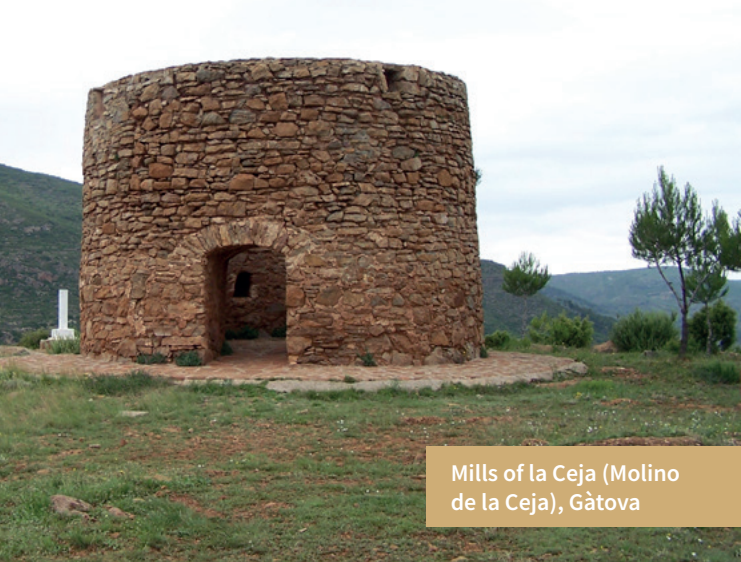
Mills of la Ceja (Molino de la Ceja), Gàtova

church of Saint John the Baptist, dating from the 18th century, the school, the doctor's house, the former shrine and the Soledad spring. The Loriguilla Natural rural tourism complex, next to the reservoir, offers accommodation for those who enjoy contact with nature.