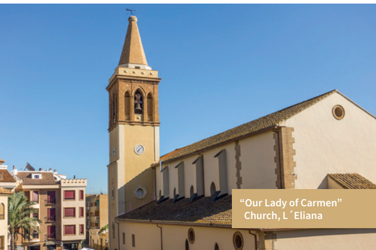
“Our Lady of Carmen” Church, L´Eliana

Loriguilla is the village divided in two. Loriguilla has the church of Saint John the Baptist, the park, the Soledad spring and the Soledad shrine. And Loriguilla Viejo, in the region of la Serranía , with the reservoir and a number of old constructions: the former