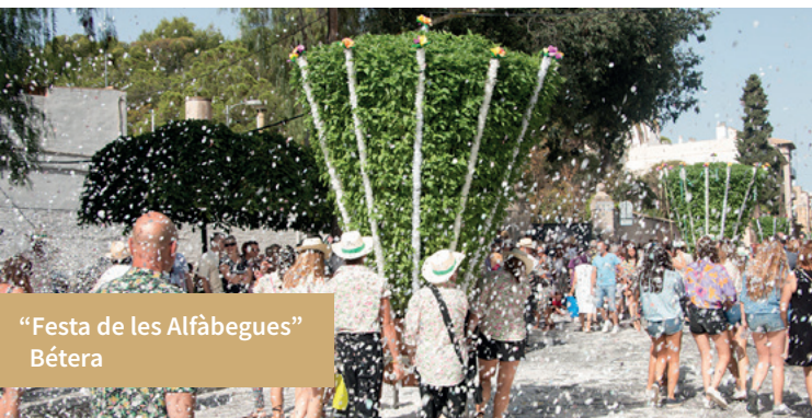
“Festa de les Alfàbegues” Bétera

Texts and Photographs: Turisme Mancomunitat Camp de Túria.