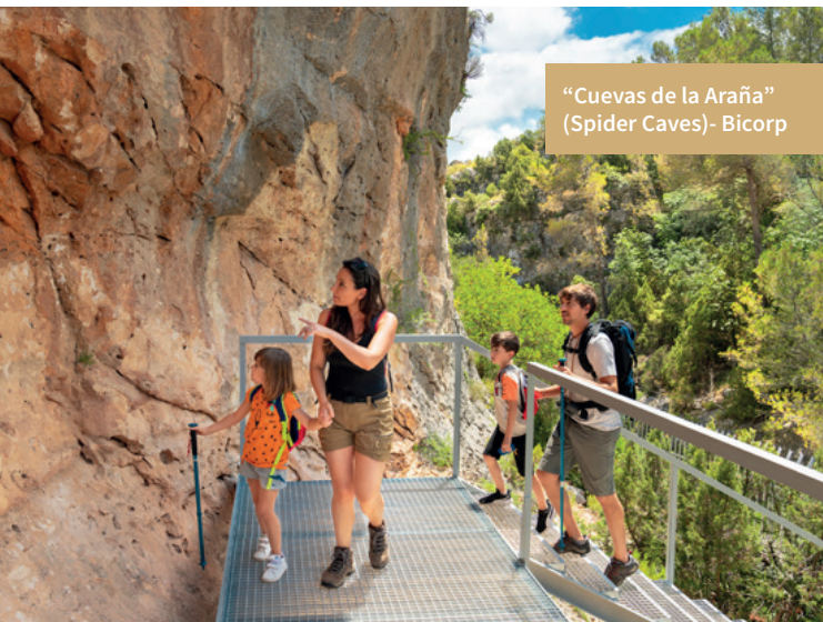
“Cuevas de la Araña” (Spider Caves)- Bicorp

As you follow the road inland, it is worth visiting the narrow, picturesque streets of each and every one of the villages, visiting natural enclaves such as: Playa Salvaje or El Salto in Chella, the beauty spot known as “ Los Chorradores ” (a succession of waterfalls) or the Playamonte lake in Navarrés, the source of the Fraile and Cazuma rivers in Bicorp, with the constant imposing outline of the Pico Caroché mountain