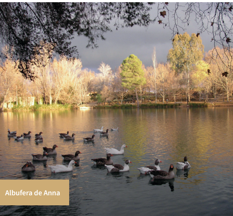
Albufera de Anna