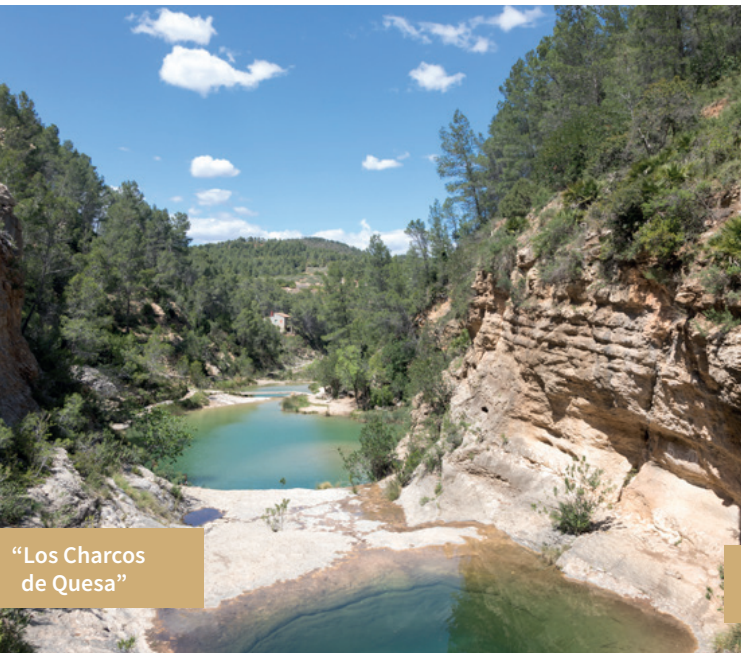
“Los Charcos de Quesa”

Handicrafts involving lace-making or work with esparto grass are common in the majority of the towns and villages in this inland region. Also highly valued are the traditional cold meats, not to mention the production of high quality honey and wine; however, without a doubt, the most highly appreciated product in the region is the excellent olive oil made here, which gives the area's gastronomy a very particular flavour.