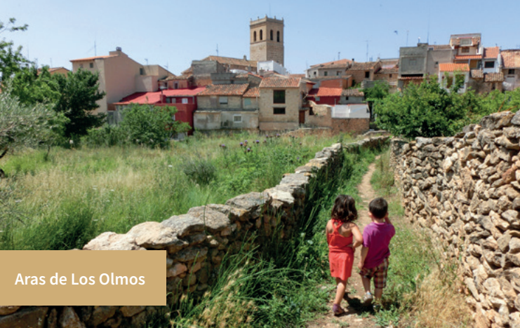
Aras de Los Olmos