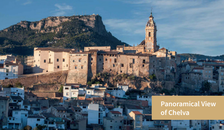
Panoramic View of Chelva

which is an impressive enclave. The river beach of Bugarra , and los Cañones del Turia as the river flows through Chulilla , a gorge with vertical walls 160 metres high and 10 metres wide.