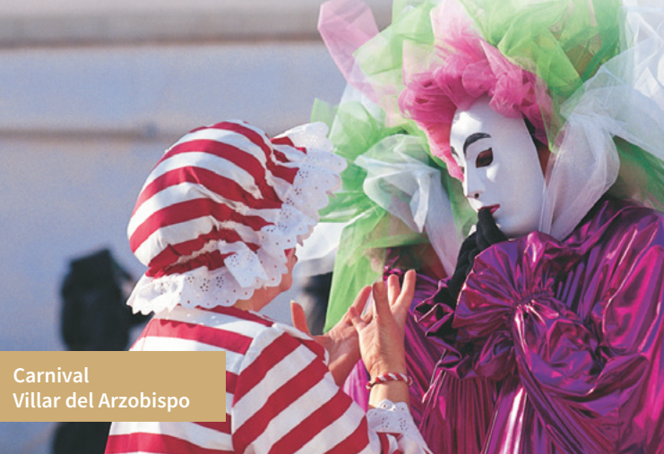
Carnival Villar del Arzobispo

of the locality's patron saint. With the August Virgin ( Virgen de Agosto ) celebrations as the main festivity (notably the one in Tuéjar , with the Entrance of the Moor ( Entrada del Moro ), every five years; and in Aras de los Olmos every seven); this completes the long list of festivals and celebrations held throughout the year. Titaguas celebrates its Patron Saint Festival in the first ten days of September, and every seven years the so-called "fiestas gordas" (big festival) take place. Another event, held on the last Saturday of July, is the Noche de las Velas : at nightfall, the public lighting is switched off and thousands of candles are lit, forming figures, as well as workshops and music performances.