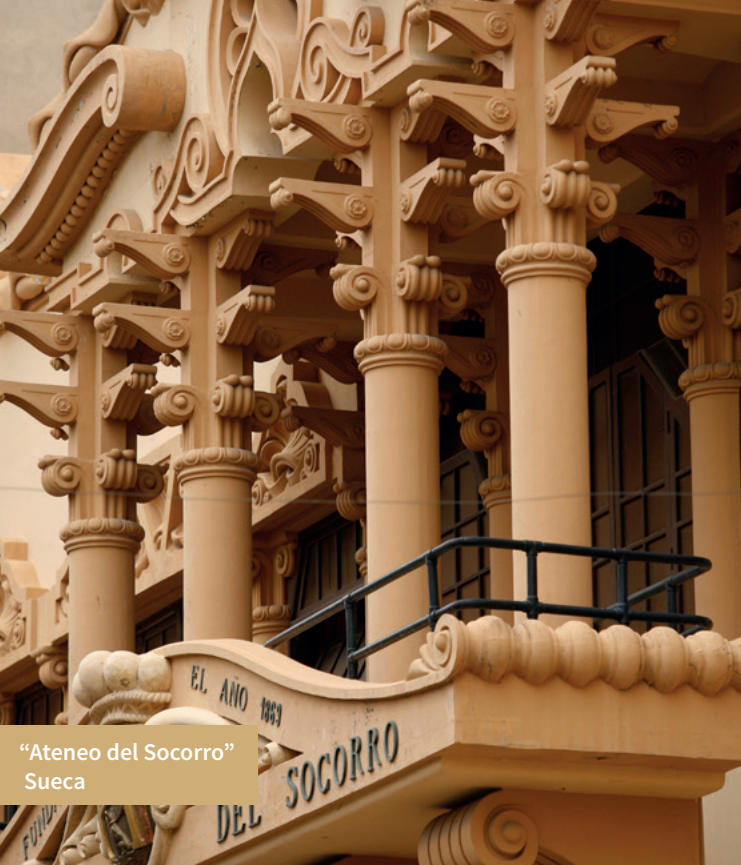
“Ateneo del Socorro” Sueca

of the Blessed Inés ( Beata Inés ). At the start of July, Hijas de María .