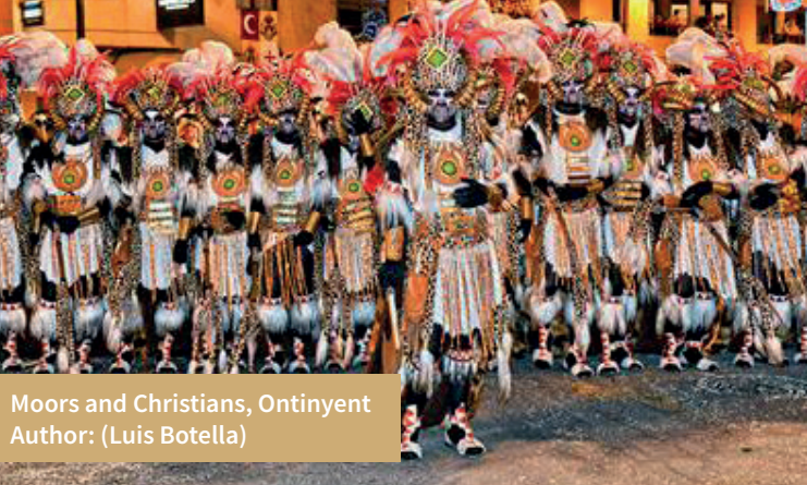
Moors and Christians, Ontinyent

Ontinyent (August), l'Olleria (September) and Albaida (October). More genuine and ancestral are the bonfires of San Antonio Abad (17 January), celebrated in almost the whole region; the night of the bonfires ( les fogueretes ) in Agullent (September); carnaval , or Mardi Gras, in Bèlgida or the Xop festival in Palomar (May). In addition, lately there has been a revival of interest in l'escaldà de la pansa (the transformation of muscatel grapes into raisins) in Benicolet , Montixelvo and Terrateig . Also worthy of note are “the dances” in Bocairent in August, declared an event of cultural interest (BIC).