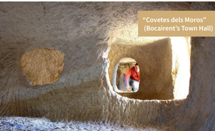
“Covetes dels Moros” (Bocairent's Town Hall)

The rock on which the town stands gives shape to the unusual and important monuments, like les Covetes dels moros (the Moors' caves), a succession of rooms and vertical and horizontal passageways dug out of the mountainside; the bullring