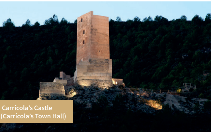
Carrícola's Castle (Carrícola's Town Hall)

A climb to the top from Beniatjar offers the chance to see villages formed from old Islamic hamlets, such as Rugat , Aielo de